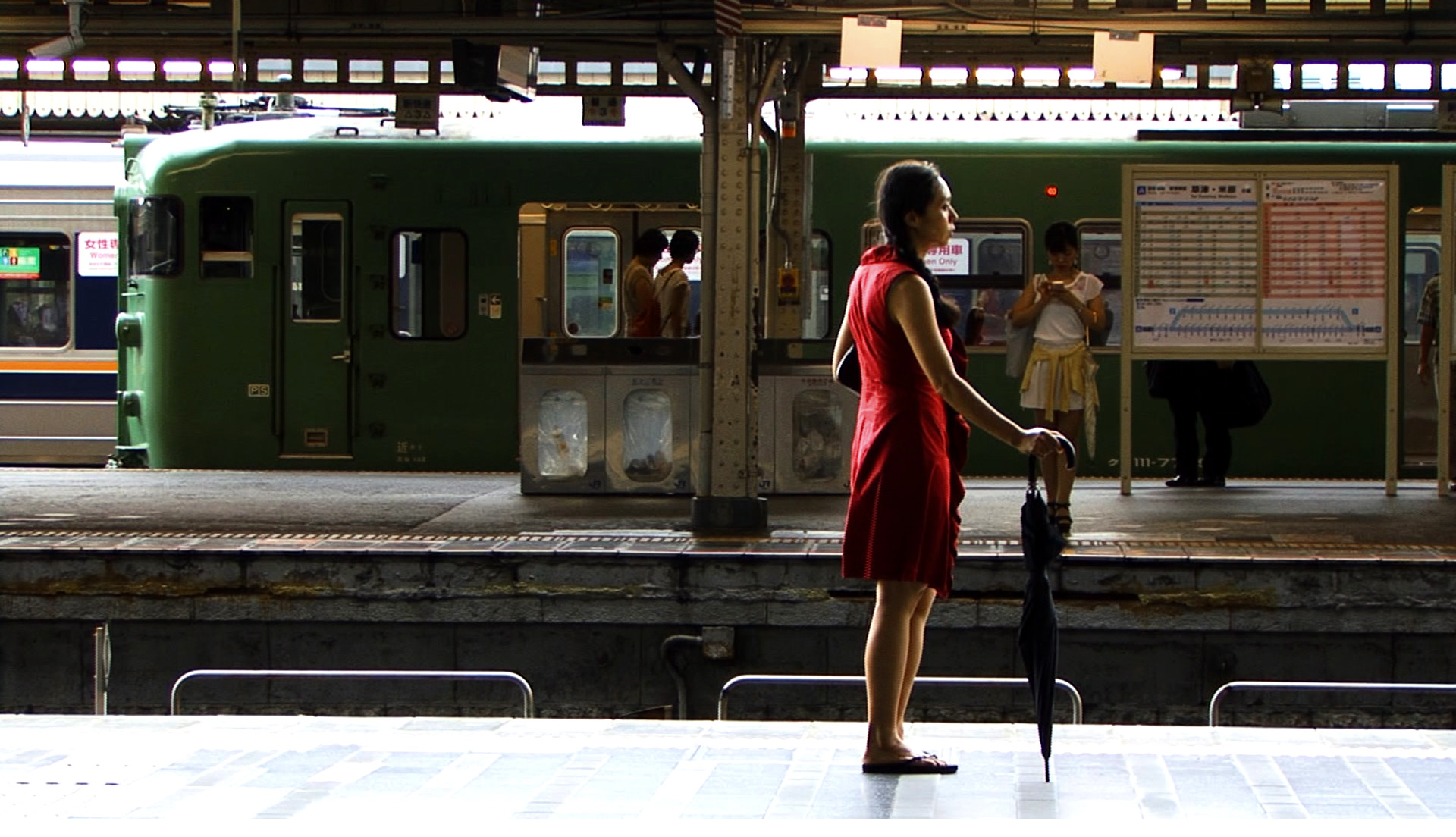
Still from Kyoka Tskamoto's film Creation and Sacrifice, 2016