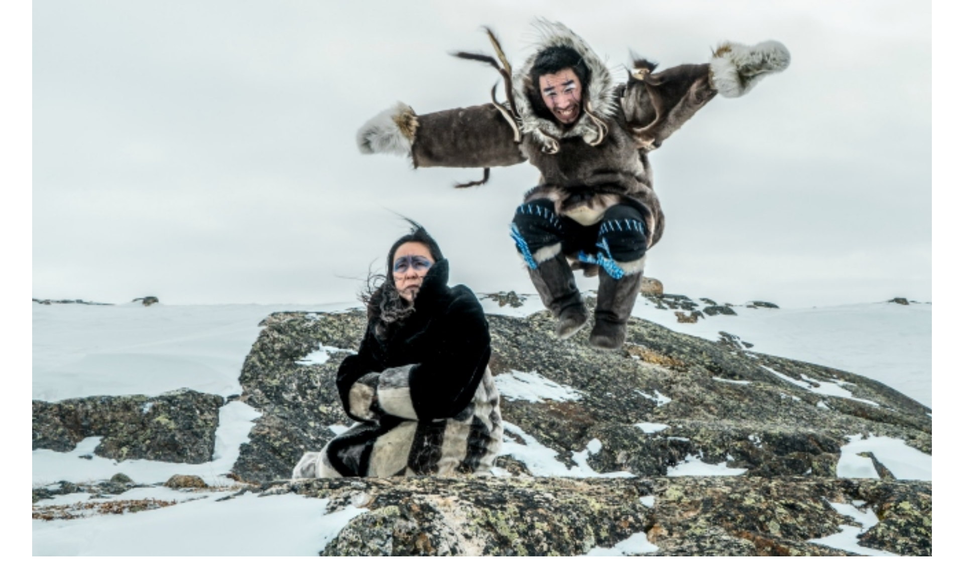
Nunavut-based Qaggiq Performing Arts Collective's Kiviuq Returns.